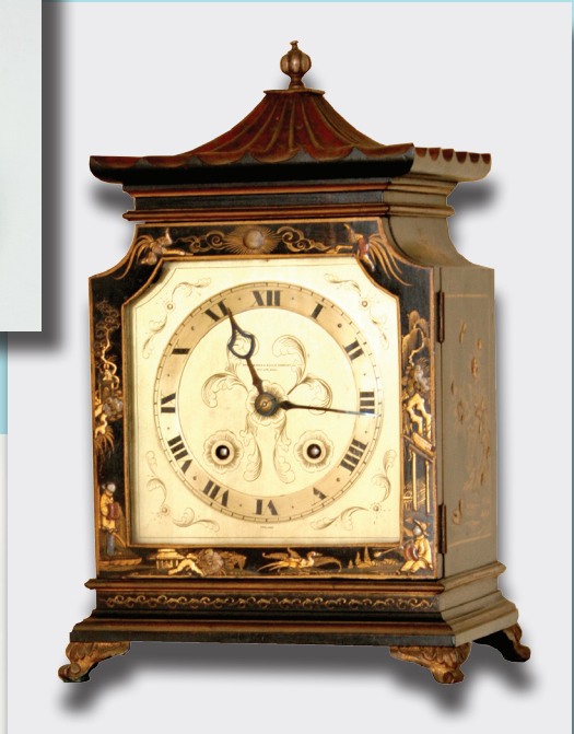
Clock Bailey, Banks & Biddle Co. circa 1900 ~$2,975

19 South Madison Street • Middleburg • Virginia