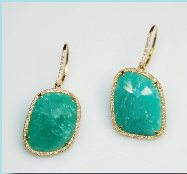
Emerald Earring with Diamonds ~ $1,995

Celebrating 40 years Fine Jewelry and Silver 1972 ~2012